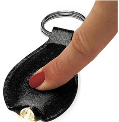
Leatherette Oval Keychain Light >> AG8642