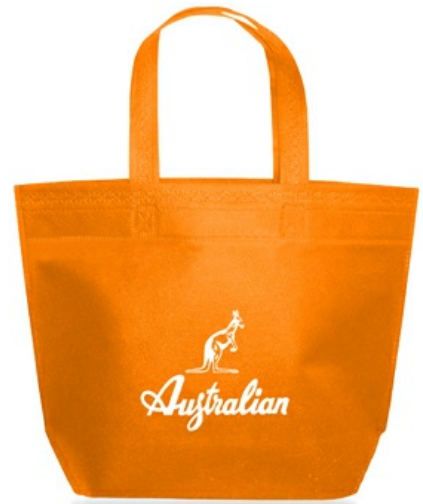
Non-Woven Reusable Tote Bag >> VJTW1