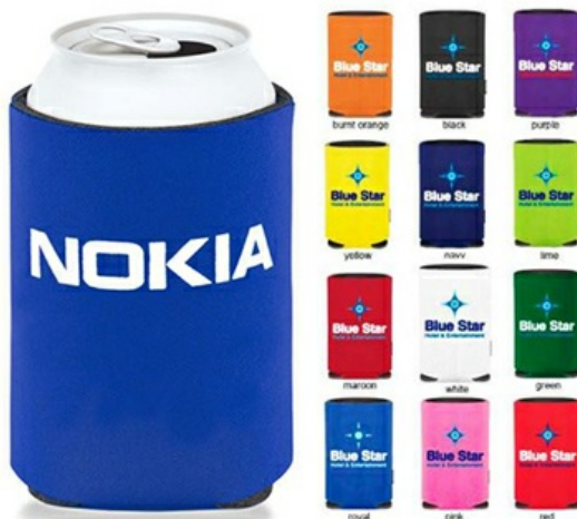
Classy Collapsible Koozie Can Cooler >> NG3849