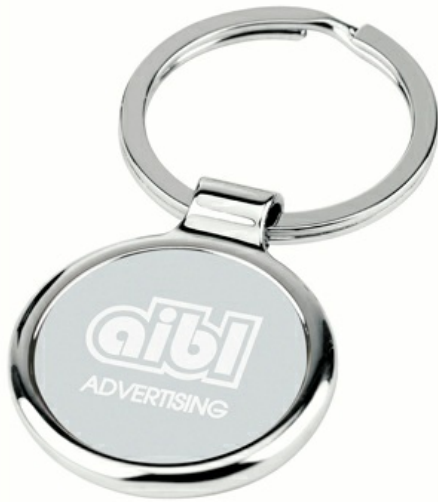
Circle EveryDay Metal Keychain >> WG8135