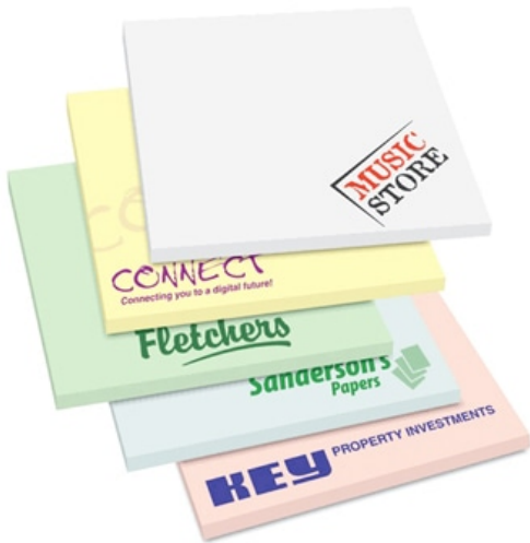
Sticky Note Pad >> MG9564