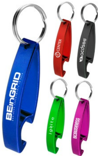
Ergo Aluminium Keychain Bottle Opener >> WG6957