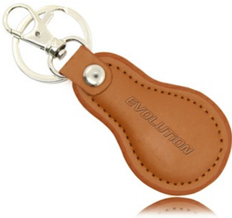
Cool Pear Shape Leather Key Chain >> EG3571