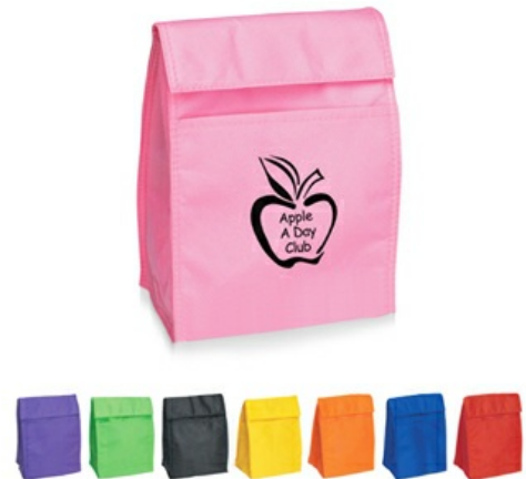
Non Woven Cooler Lunch Bag >> GG1496