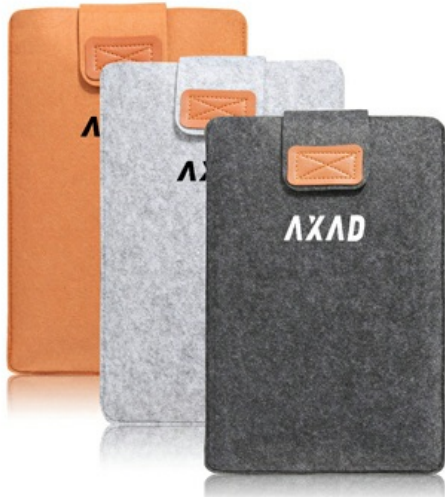
Portable LSS Soft Laptop Sleeve Case >> CG1329