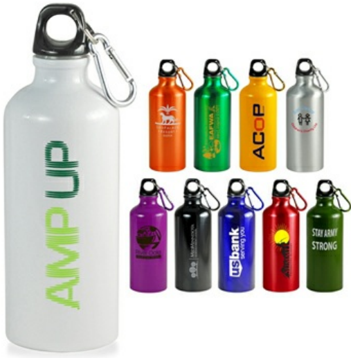
400ML Ultimate Aluminum Sports Bottle >> SG2654