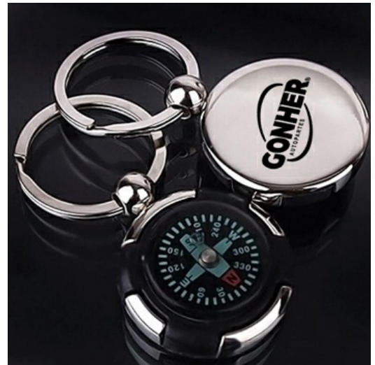
Mini Portable Compass Keychain >> KG3219