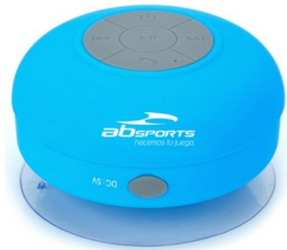
Bluetooth Shower Speaker With Suction Cup >> LG6897