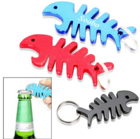
Fish Bone Bottle Opener Keychain >> BG6185