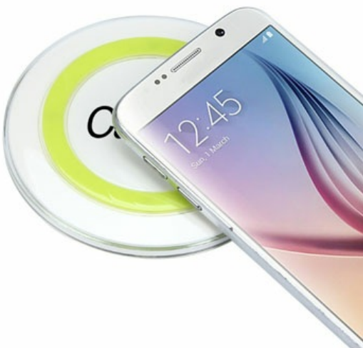
Qi-Enabled Wireless Fast Charging Pad >> FG1827